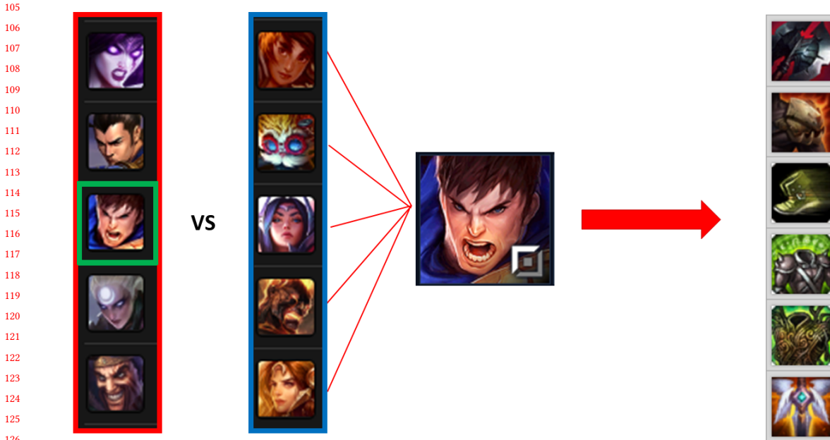
Fig. 1. For this case with the current champion selection for both teams (red and blue), one champion is selected for item recommendation. We concentrated on the enemy team as context to reduce the search space.

interest, where most works focused on collaborative filtering for the recommendation of items for role-playing games [3, 13, 18].